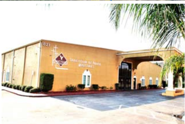
Youth center/Admin Building