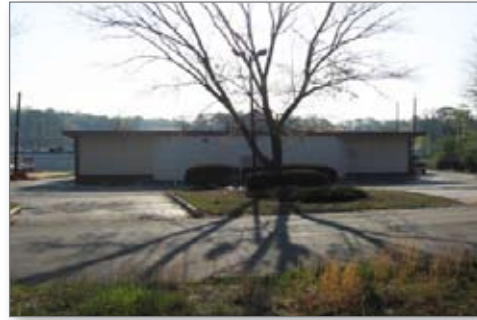
Front view of church