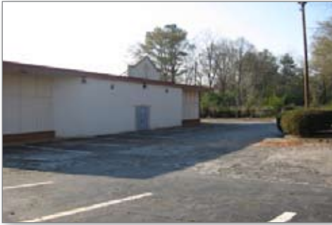
Front view of church